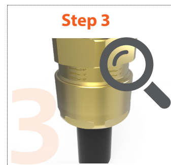
The backnut should be level with the marking guide corresponding to its diameter – this can be visually inspected and adjusted as necessary

Note: The cable gland installation instructions have a printed cable OD measure for if the cable OD is not known