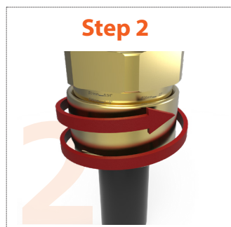
Tighten backnut until a seal is formed onto the cable, then tighten one further turn