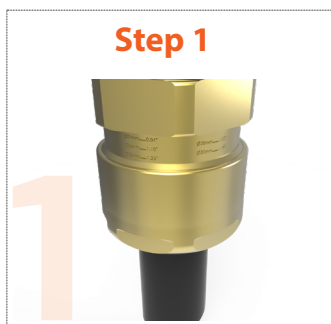
Follow cable gland installation instructions until final stage – tightening of rear seal

The gland is permanently marked with various lines/numbers indicating the correct tightening level related to the cable diameter. Following the relevant cable gland Installation Instructions, the back seal should be tightened until a seal is formed on the cable outer sheath and then tightened one further turn.