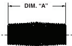
AN-1 to 0