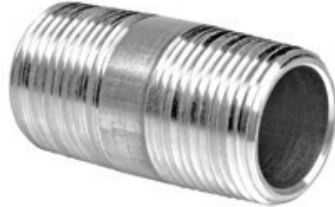
AN - 2B