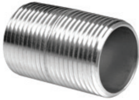
AN-1 to 0